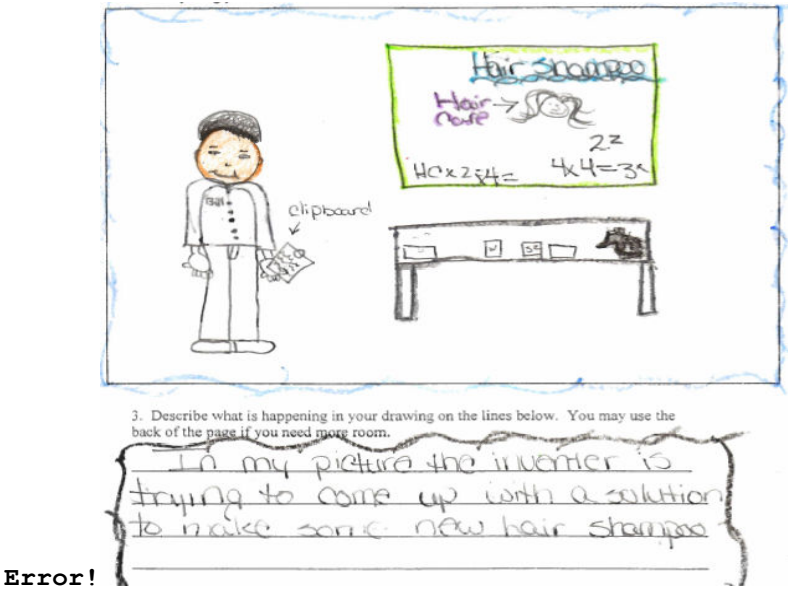
Figure 4, Project Student Work Sample. Caption reads, "In the picture is the inventor trying to come up with a solution to make some new hair shampoo".

In addition to those differences captured by the Scoring Guide, further analysis identified key distinctions in student portrayals of the engineers themselves. For example, project students were more likely to portray female engineers, with 18% of their drawings depicting female engineers. Similar depictions were found in only 7% of control group work samples. Project students also included greater percentages of minority engineers, with 30% including minority engineer depictions. This is contrasted with control group depictions that included minority engineers in 11% of the work samples.