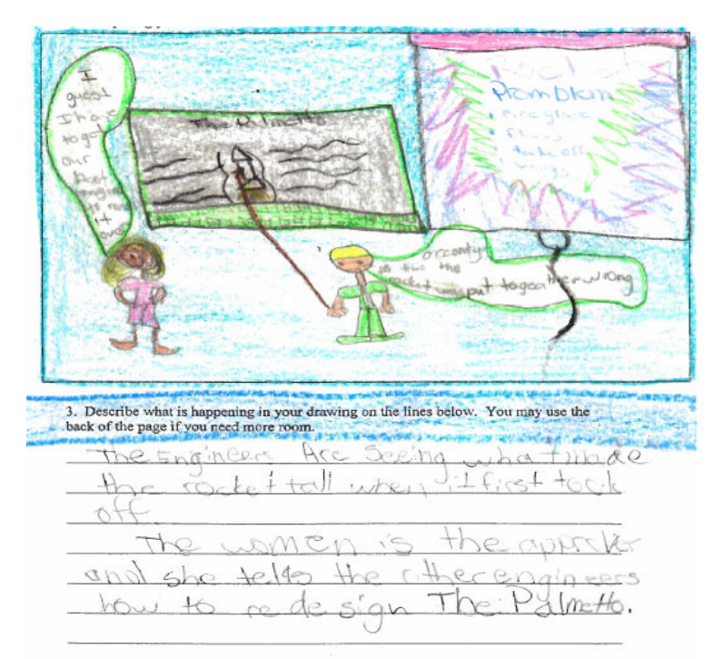
Figure 3. Project Student Work Sample. Caption reads, "The engineers are seeing what made the rocket fall when it first took off. The woman is the approver and she tells the other engineers who to redesign the Palmetto".

Project student work samples and interview data also emphasized making things better and problem solving as important engineering processes. Figure 3 demonstrates the notions of engineer as problem solver as well as the focus on mental aspects of engineering previously discussed.